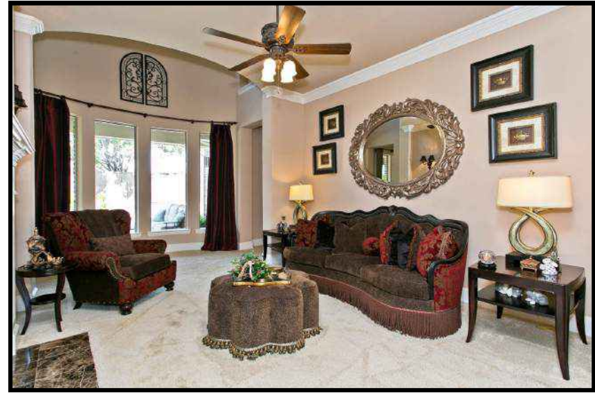
Floor to Ceiling Paneless Windows with Elegant Window Treatments.