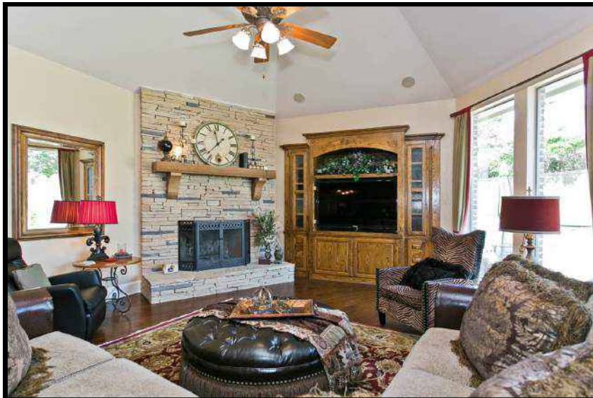
Family Room with Stacked Brick Fireplace, Hearth & Cedar Mantle. Entertainment Center & Surround Sound