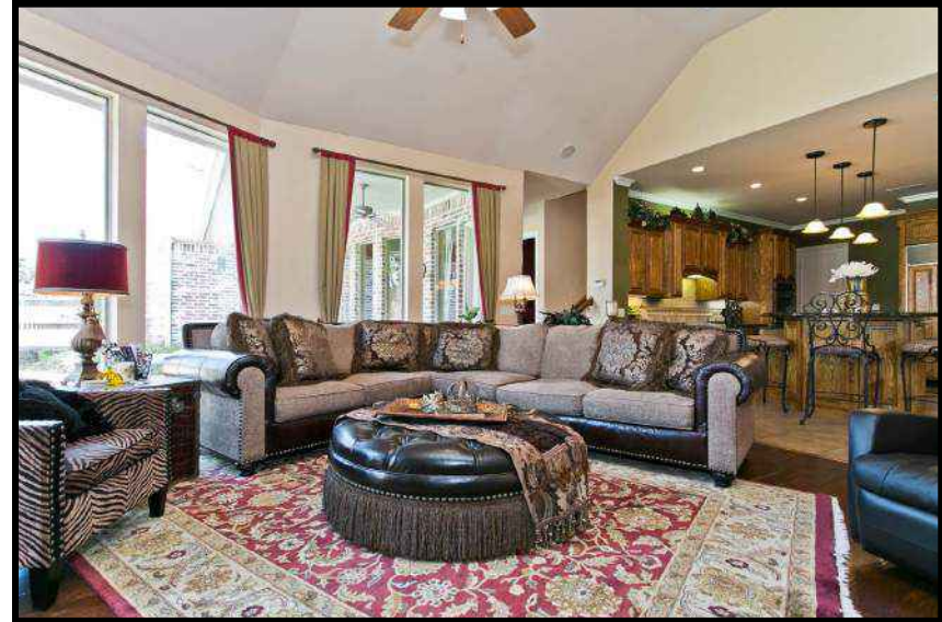
Vaulted Ceiling & Hardwood Floors Amazing view of covered patio, pool and yard!