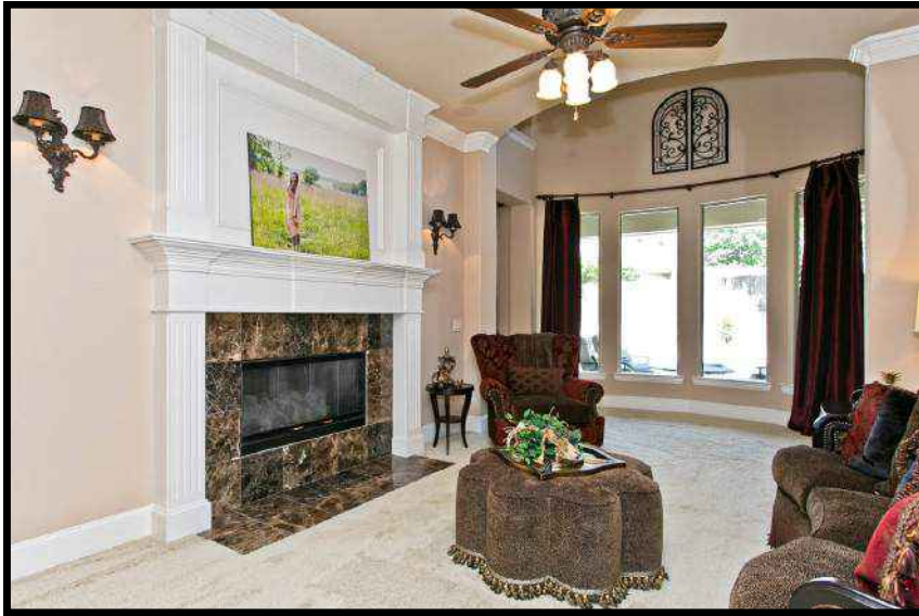
Formal Living with Extensive Millwork framing the Fireplace with Double Stacked Custom Mantle